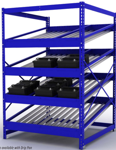
Also available with Drip Pan and Lane Dividers.

Borroughs is known nation wide, as a premier designer and manufacturer of storage equipment solutions for industrial, automotive, and general storage applications. Our new free-standing Battery Rack is made of our durable steel and comes in 4 different sizes and variations. These racks accommodate a variety of battery sizes and types; a great addition to any automotive service area.