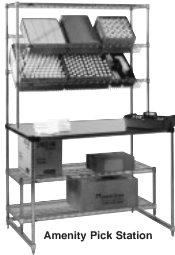
Amenity Pick Station

Equip and organize the housekeeping cart prep area with Storage/Pick stations and high-density Tote Storage Cart.