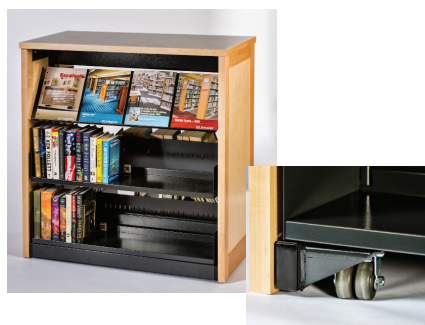
Concealed Caster Units