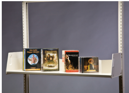
Zig Zag Display Shelf