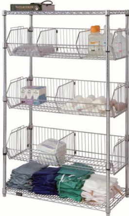
Wire Baskets for Dispensing