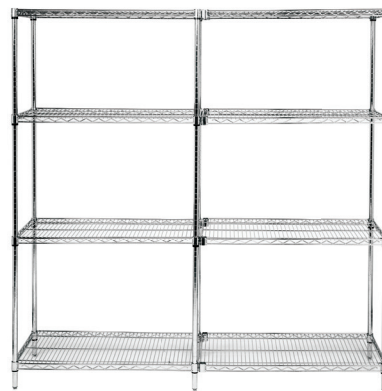
Starter & Add-On Unit