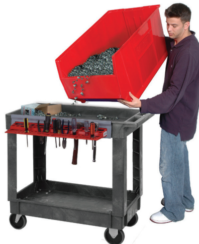
Warehouses & Manufacturing