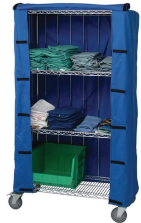
Enclosed-side Carts with Velcro Covers