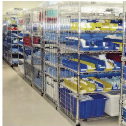
Sliding Floor Track Mobile