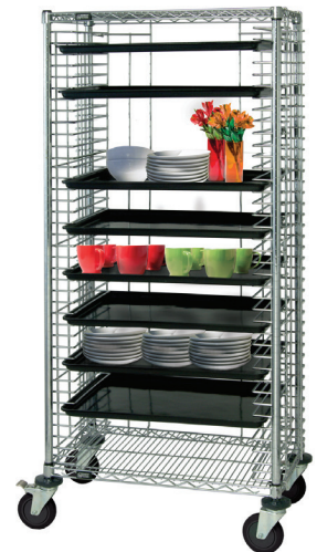
Food Service & Cafeteria