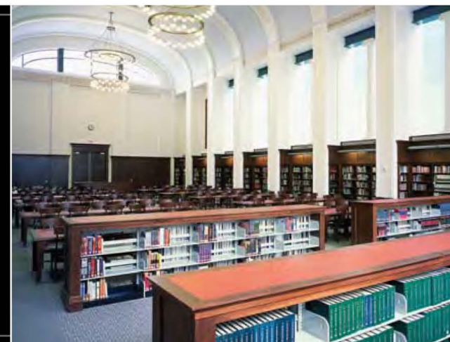
Nashville Public Library – Nashville, TN | Architecture by Robert A.M. Stern Architects – New York, NY

Your library is unique, and you'll find that our Estey Cantilever Library Shelving System accommodates your needs unlike any other shelving available. Estey Cantilever Library Shelving is designed to be functional, versatile, and aesthetically beautiful. Our components are fully interchangeable allowing you to expand or reconfigure as your needs change. And, numerous quality construction features such as superior multibend uprights, sturdy brackets, adjustable levelers, and a powder coated paint finish also provide durability, practicality, and flexibility that offer years of quality performance.