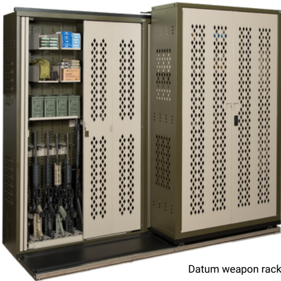
Datum weapon racks sold separately.