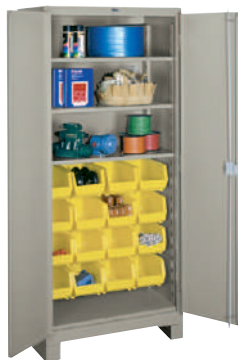
36"w x 21"d No. 1123