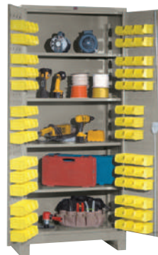
36"w x 21"d No. 1155