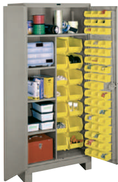
36"w x 21"d No. 1122

Removable plastic parts bins increase storage density, speed selection, and retrieval. Corrosion resistant, and impervious to most solvents, Safety Yellow plastic bins easily clip on and off racks welded to cabinets and doors. Easily add or remove shelves and bins as needed.