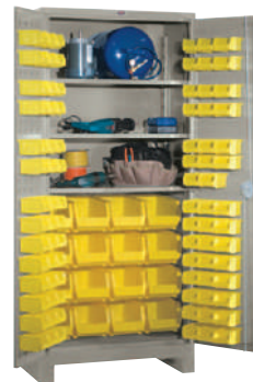
36"w x 21"d No. 1156