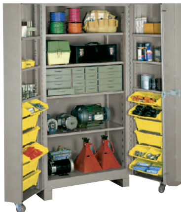
36"w x 21"d No. 1127