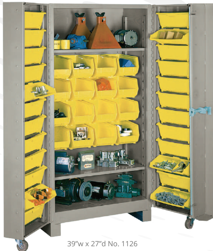
39"w x 27"d No. 1126

Removable plastic parts bins increase storage density, speed selection, and retrieval. Corrosion resistant, and impervious to most solvents, Safety Yellow plastic bins easily clip on and off racks welded to cabinets and doors. Easily add or remove shelves and bins as needed.