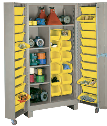
36"w x 21"d No. 1128