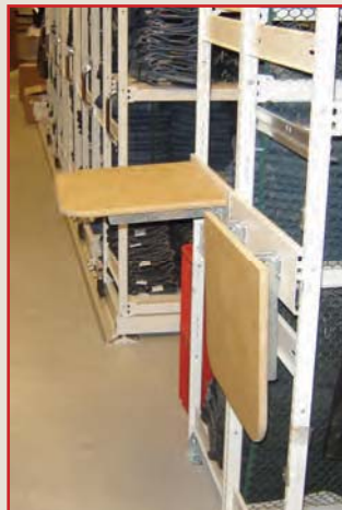
Drop Down Tables